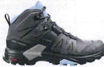
b) Safety field boots X Ultra 4 Mid wide Gore-tex women