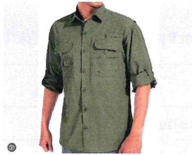
long Sleeve fishing safari/field shirt