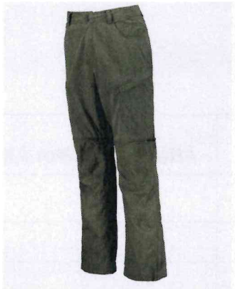
d) Xplorer Gorge 2.0 trouser