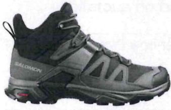
a) Safety field boots X Ultra 4 Mid wide Gore-tex men