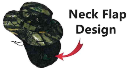
f) Unisex Bucket Hat with neck cover flap