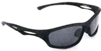
e) Full wrap sunglasses (polarised)